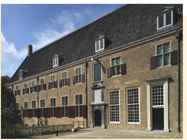
Plate 3 The cloister in the Museum Catharijneconvent.