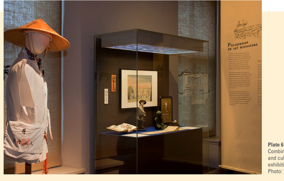
Combination of contemporary pilgrims' attributes and cultural historical objects from the Pilgrims exhibition Photo: Ruben de Heer, 2011.

The first exhibition's theme was the traditional Christian pilgrimage to the Spanish town of Santiago de Compostela,