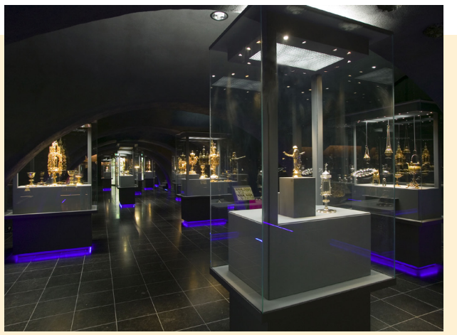
Plate 2 The Treasury in the Museum Catharijneconvent.