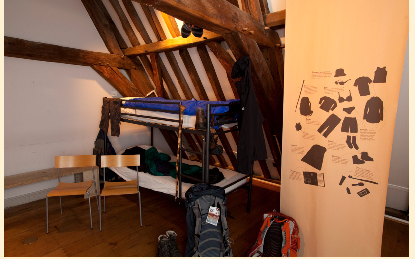
Plate 7 The 'albergue' turned out to be a popular meeting point for visitors at the exhibition Pilgrims. Photo: Ruben de Heer, 2011-12.