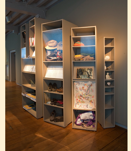
Plate 8 Contemporary pilgrims' attributes at the Pilgrims exhibition. Photo: Ruben de Heer, 2011-12.