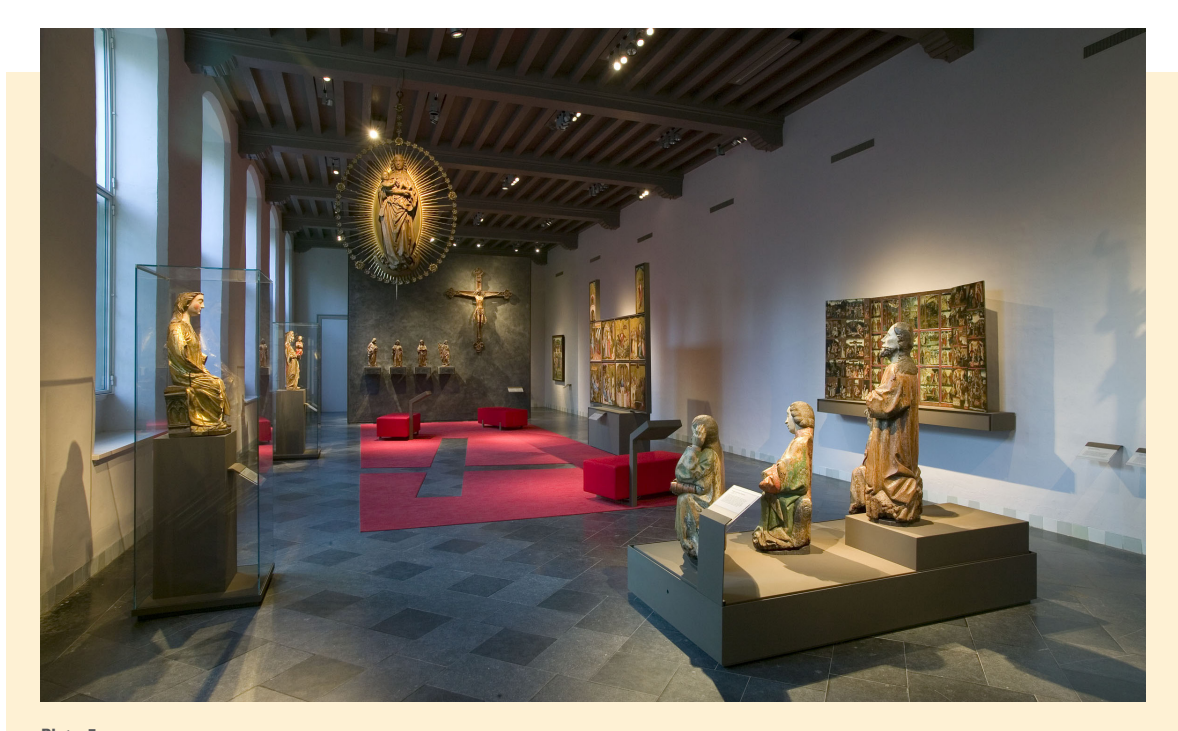
Plate 5 The former refectory with medieval masterpieces in the Museum Catharijneconvent.

of a wide array of articles (prayer beads, statuettes, crucifixes, devotional prints, souvenirs of pilgrimages, cribs, tablecloths decorated with biblical scenes, holywater fonts, mission boxes, bibles, hymn books, and so on), constituted the cultural-historical collection. Next to nothing has been published on the collection, while the museum had only organised a single exhibition in 1996, on Roman Catholic devotional objects between 1900 and 1950. The museum's collecting policy for the period 2017-2020 still refers to such items as 'mass products' of inferior art historical value, thus undervaluing them and unintentionally prohibiting collecting them in any systematic way.