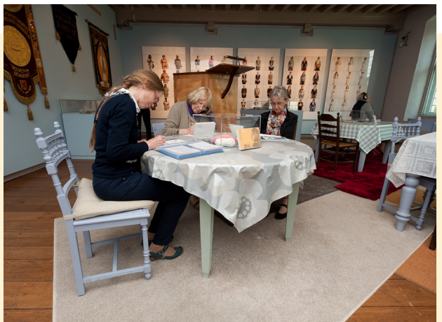
Plate 9 Sharing stories at the exhibition Women in the Spotlight . Photo: Ruben de Heer, 2012.