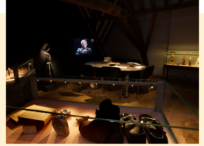
Plate 15 Personal objects and stories at the exhibition Francis Photo: Ruben de Heer, 2016.

to the exhibition's concept and attended brainstorming sessions with the designers. As in the case of Pilgrims , three experience experts were present every day to communicate with visitors, making use of a showcase exhibiting personal items as a means of breaking the ice. According to the experience experts, the exhibition evoked many memories; visitors, of whom the large majority valued the opportunity to talk with the volunteers, often felt the need to share their experiences immediately. This was unexpected: the experience experts listened more often than they spoke.