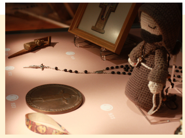
Plate 14 Personal objects at the exhibition Francis .